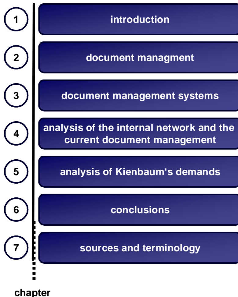
Illustration 2: Structure of the thesis 5

The last chapter will present all sources which might be of use in the context of document management systems. A short list of key terminology / abbreviations is given.